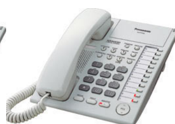
■ KX-T7750 Monitor Unit